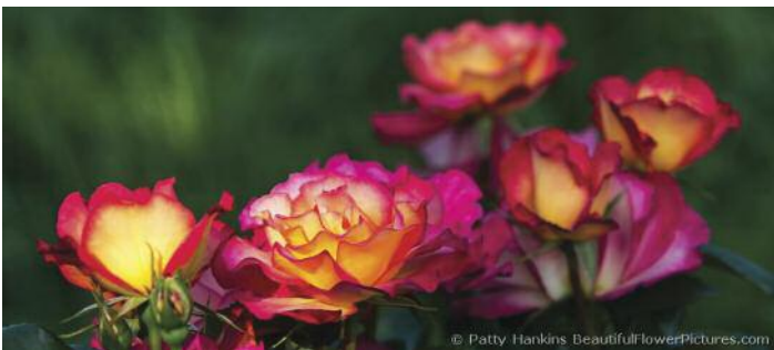
Rainbow sorbet rose

Email us: n.newton@verizon.net and/or dbsvenonius@msn.com