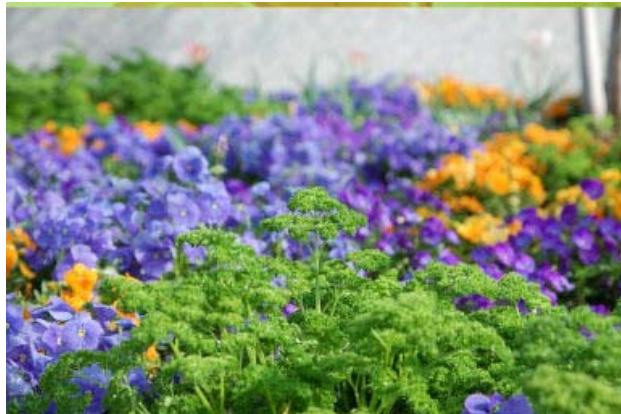
Parsley and Pansies Make a Lovely Fall Flowerbed

Agastache foeniculum Larkspur Asclepias (milk weed) Herbs (flowering) Thyme Lemon balm Lavender Feverfew Sage Santolina (repels moths) Nasturtiums Dill (flowering)