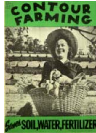
Contour Farming was Encouraged

And the posters also reflected how recommendations for the most productive and sustaining farming practices have changed over time.