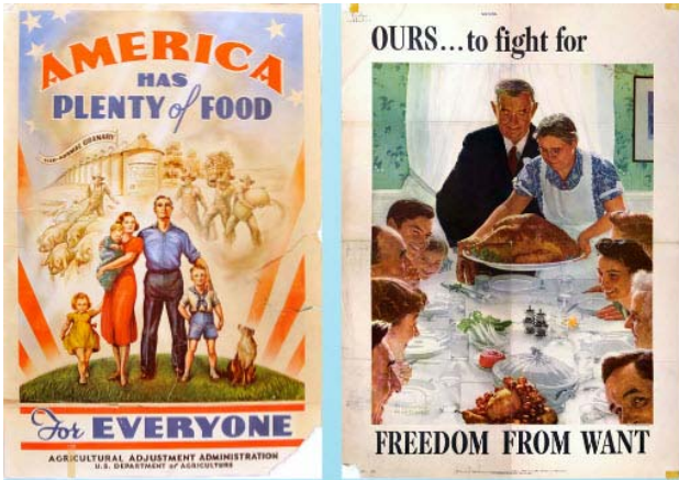
Victory Garden Posters from WW1 and 2

Reviewing the posters, it was interesting to see how recommendations for farming and eating have evolved over time.