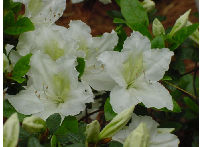
Azalea 'Takoma Park'